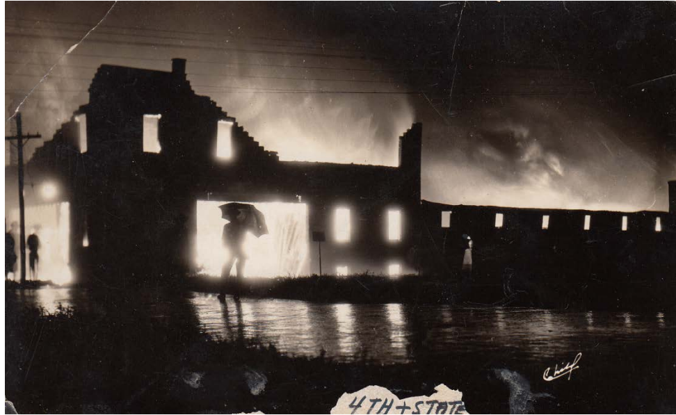
Fire at Fourth Avenue and State Street in Grinnell, Iowa. Possibly the Bell Camera Company building which burned in 1918.

Home » DG Annotation Webform » Webform results