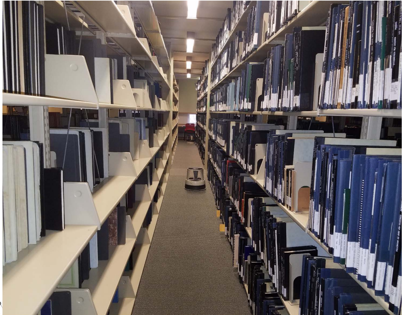
Photo of empty shelves facing scores