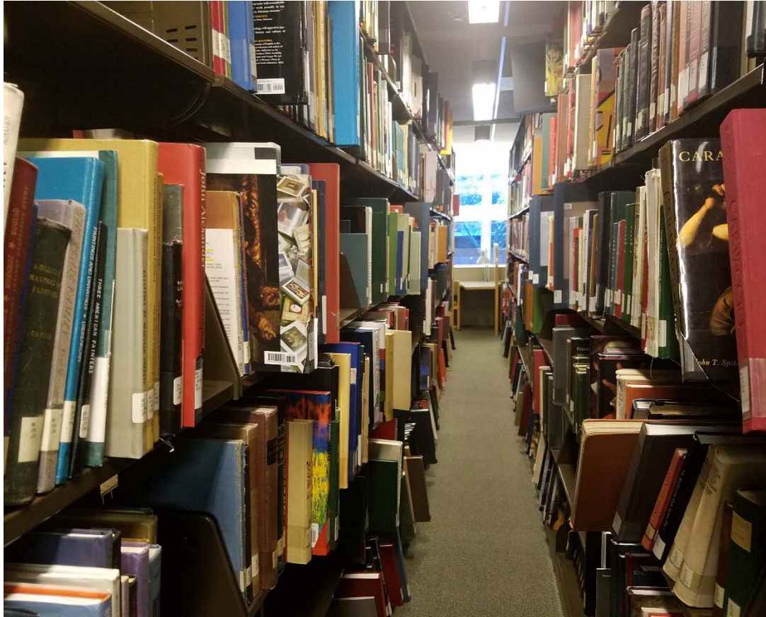
Photo of cramped aisle on 2 nd floor.